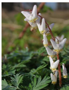
Dutchman's Breeches Dicentra cucullaria