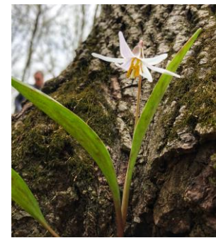
Trout Lily Erythronium albidum