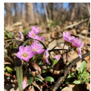
Spring Beauty Claytonia virginica