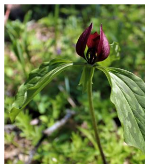
Prairie Trillium Trillium recurvatum