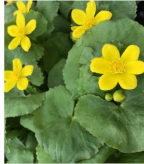
Marsh Marigold Caltha palustris