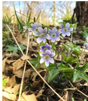
Sharp-lobed Hepatica Hepatica acutiloba