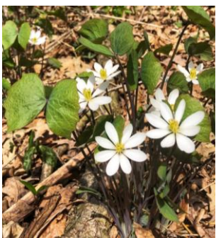
Twinleaf Jeffersonia diphylla