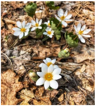
Bloodroot Sanguinaria canadensis

Ready for a dose of color after a long winter? Get out and enjoy the first wildflowers of the new year with ephemerals . But hurry! As the name implies, these flowers don't last long; ephemeral literally means "lasting a very short time." These are just some of the ephemerals you can find in our woodland habitats. Take a hike at Norris Woods, Delnor, Persimmon Woods, the native garden behind Pottawatomie Community Center or Hickory Knolls Natural Area. Print out and take along this guide or keep it handy on your phone. Ephemerals are especially adapted to woodlands to emerge, bloom and set their seed before the surrounding trees leaf out and shade out the forest floor. So hurry, so you don't miss these beautiful native plants. For more on the woodland spring flowers of our area, check out the Field Museum's guide to Woodland Spring Fauna of the Chicago Region; https://fieldguides.fieldmuseum.org/guides/guide/513