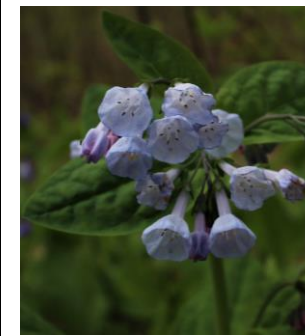
Virginia Bluebells Mertensia virginica